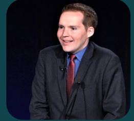
Coffee With Cathy Webinars Page 6