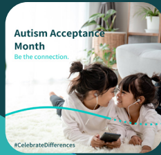
Autism Acceptance Month Page 3