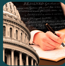
Legislation Page 5