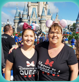
Family Retreat Page 4