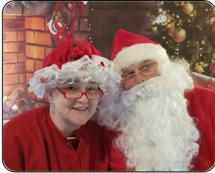
Virtual visit with Santa & Mrs. Claus

There are three rides to choose from: 10-mile, 25-mile, and 50-mile, all are family friendly and have some great scenic views! After the ride, enjoy an amazing BBQ lunch and relaxation at the beautiful grounds of the Conservation Trust. The ride is a great time and a wonderful way to spend some time with family and friends, supporting a great cause. Your ride awaits!