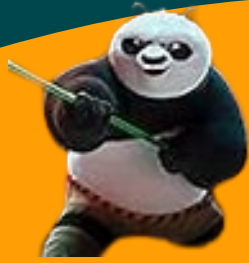
KUNG FU PANDA 4 Sensory Showing pg.3