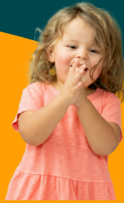
April Autism Acceptance Month pg. 6