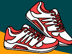
Walk for Autism pg. 7