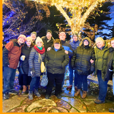
ASM's Support Groups Page 7