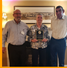
Award Ceremony Page 6