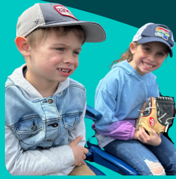
Sea Dogs Game pg. 7