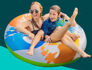
Water Safety pg. 8