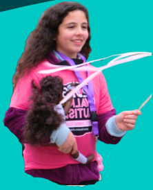
Walk for Autism pg. 3