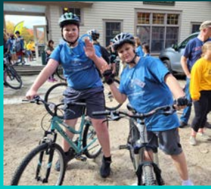
Ride for Autism Page 6