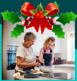
Holidays Page 4