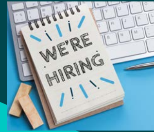
ASM is Hiring! Page 5