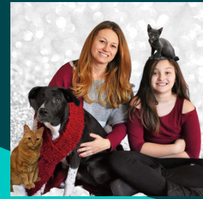
AIS Program pg. 3